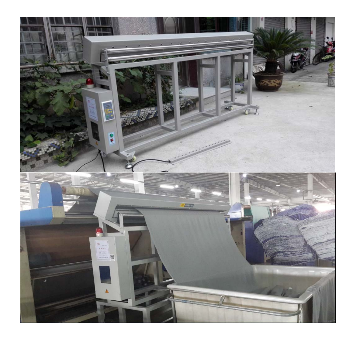
2300 Instruction on Use and Maintenance